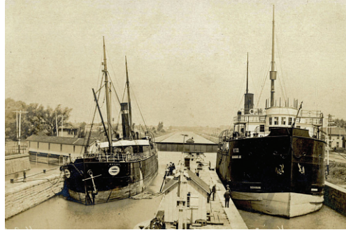
Two Steamships in the locks just south of the railroad bridge at Port Colborne, c.1920. PCHMM 2007.5.42