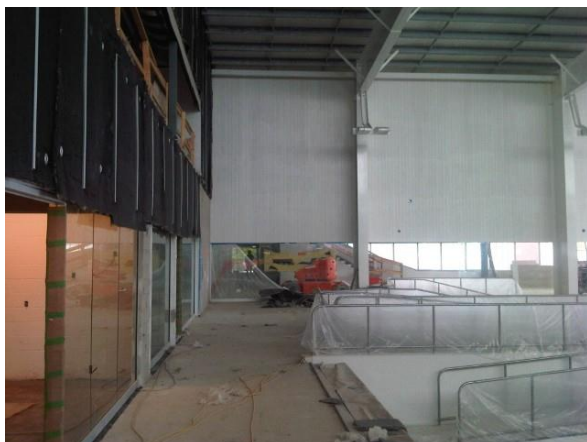
Lap pool tiling is nearing completion. Glazing installation is underway.