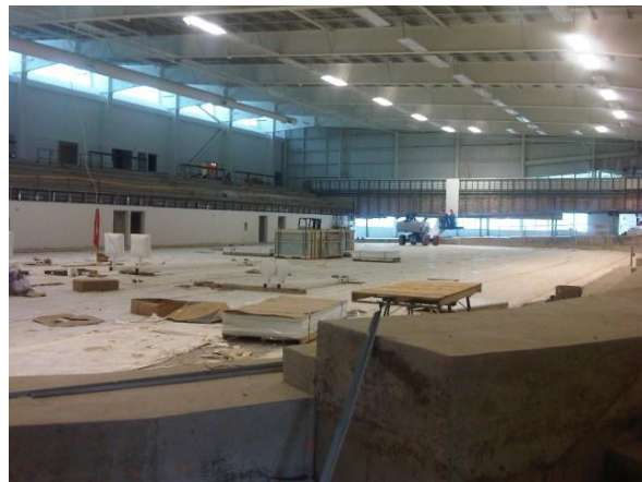
Arena 1 – interior finishes are ongoing.