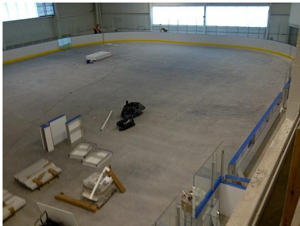
Arena 2 – interior finishes are ongoing.