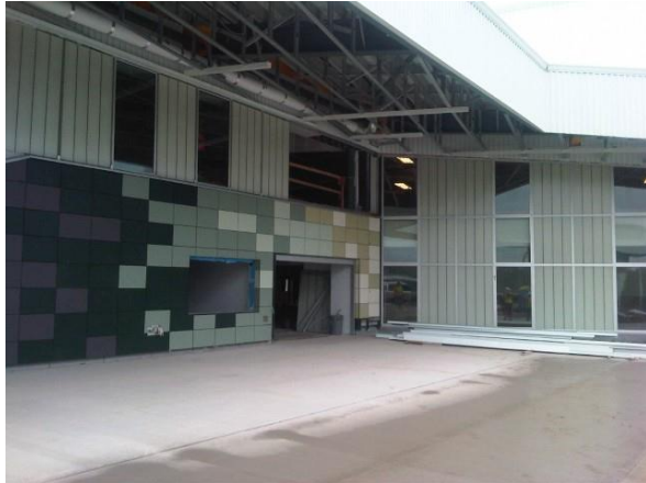
Building main entrance