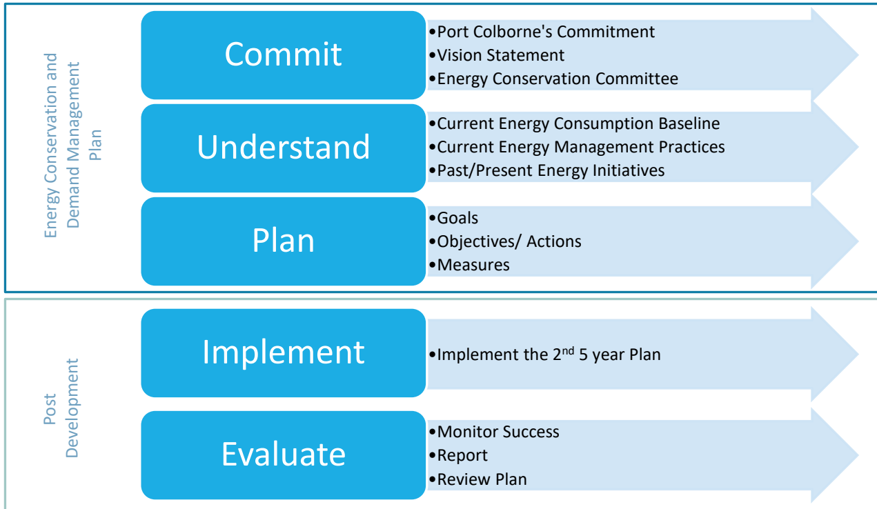
Figure 1: ECDM Plan Framework